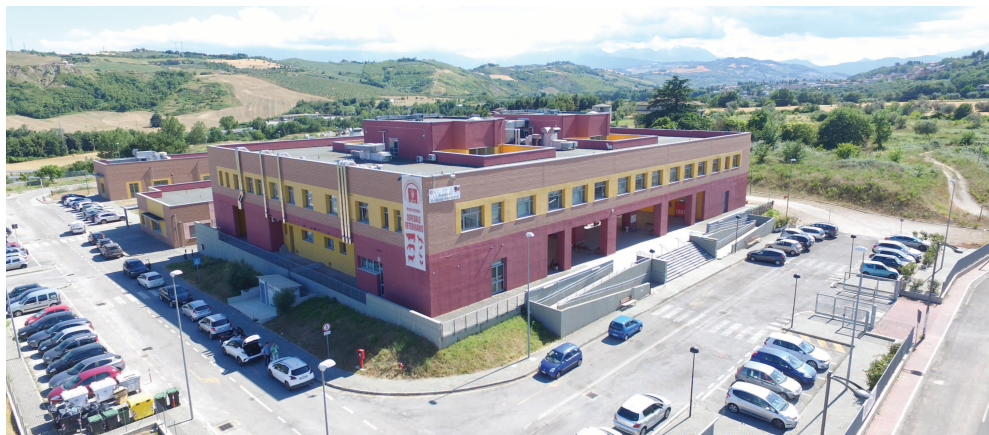
Ruggero Bortolami Campus