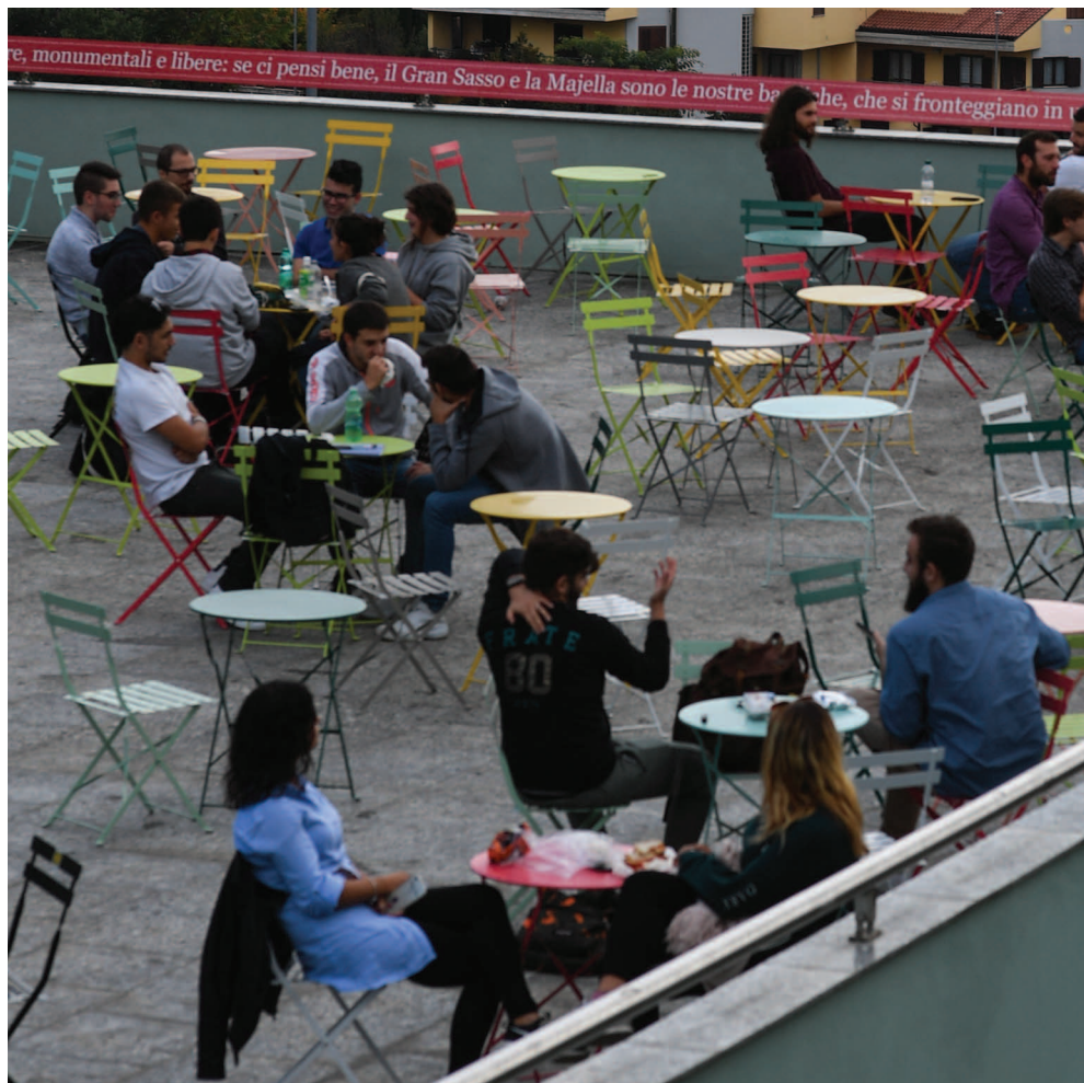
The terrace of the Aurelio Saliceti Campus