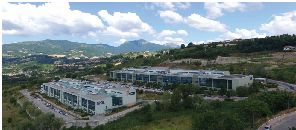
Aurelio Saliceti Campus